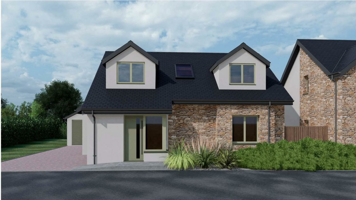
1429 3D VISUALISATION 08